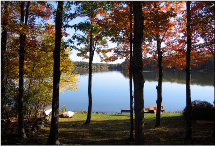
A Pocono Mountain lake in October.

Sources: www.800poconos.com www.etymonline.com "Passion in the Poconos," by Susan Spano. Smithsonian Magazine , June 1, 2012. Smithsonianmag.com