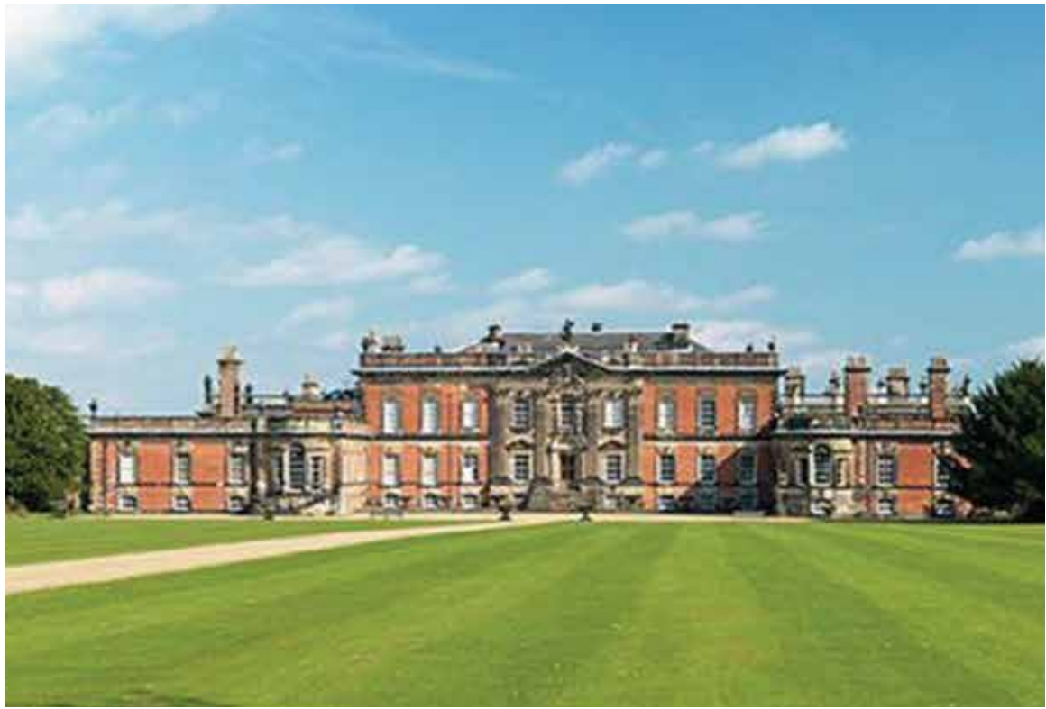
Wentworth Woodhouse — one of the houses that inspired the fictional Pemberley estate, in Rotherham, UK.