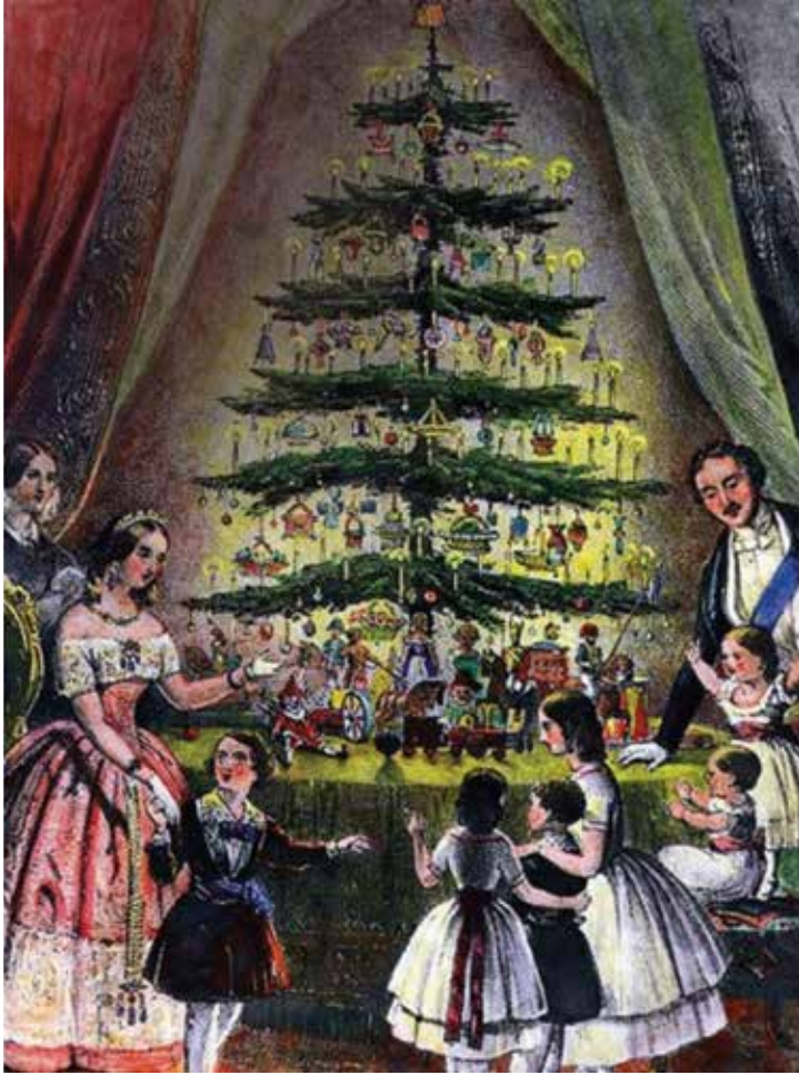
Engraving of Queen Victoria, Prince Albert, and the children with their Christmas tree.

AN ENGRAVING OF THE ROYAL FAMILY CELEBRATING CHRISTMAS AT WINDSOR CASTLE WAS PUBLISHED IN 1848 AND SOON AFTER THEIR GERMAN TRADITIONS WERE ADOPTED WORLDWIDE.