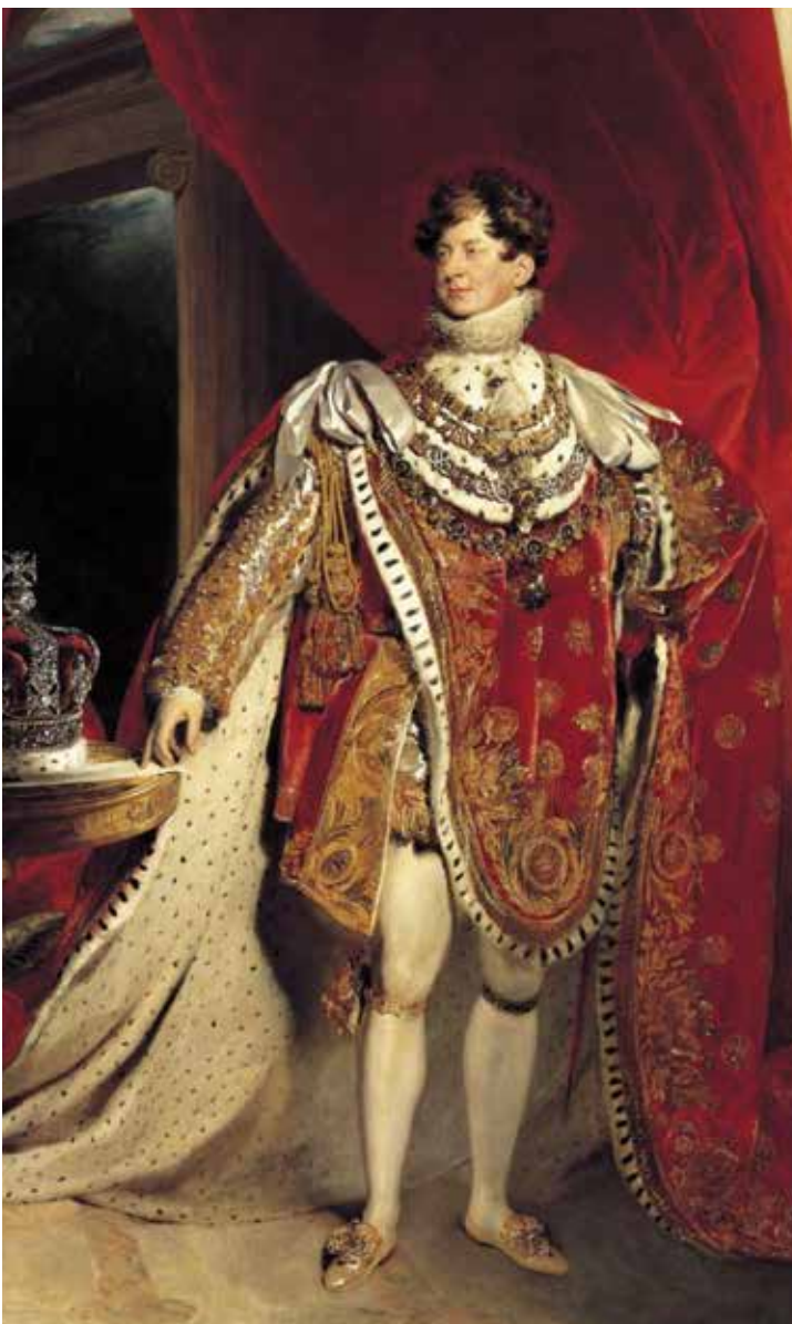
Portrait of the Prince Regent's coronation by Sir Thomas Lawrence in 1821

THE NOVEL PRIDE AND PREJUDICE AND THE PLAY MISS BENNET: CHRISTMAS AT PEMBERLEY ARE SET IN IS THE REGENCY ERA. THIS ERA ENCOMPASSED A TIME OF GREAT SOCIAL, POLITICAL, AND ECONOMIC CHANGE. IT IS ALSO KNOWN FOR ITS ELEGANCE AND ACHIEVEMENTS IN THE FINE ARTS AND ARCHITECTURE.