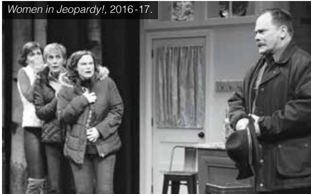
Women in Jeopardy! , 2016-17.