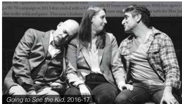
Going to See the Kid , 2016-17.