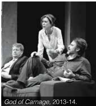
God of Carnage , 2013-14.