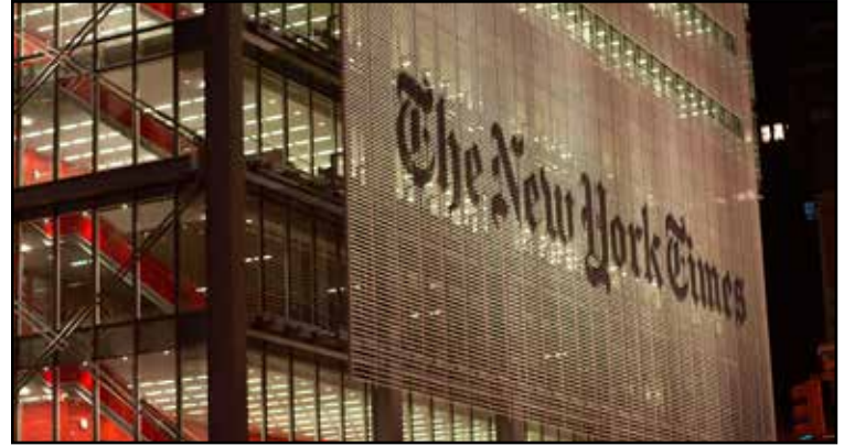
The industry term for obituary writing at papers like The New York Times is "Walking the Dead Beat."

While most death notices are written by the family and friends of the deceased, major papers like the New York Times have full-time staffers who write just obits—the industry term is "walking the dead beat."