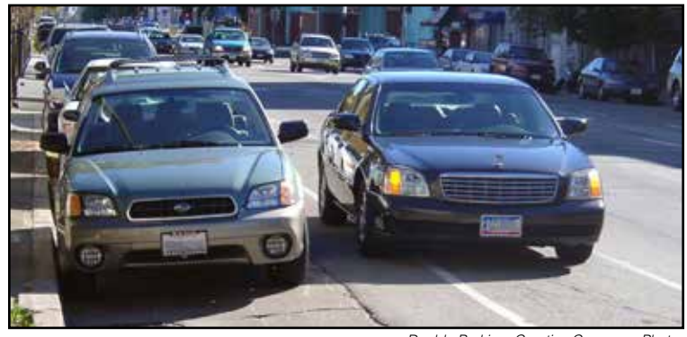
Double Parking