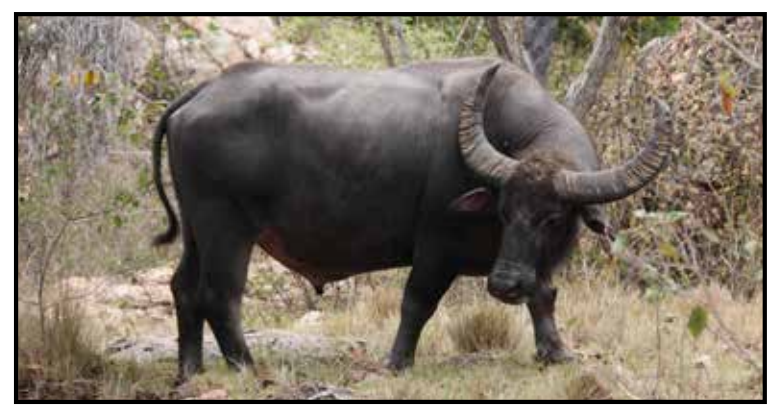
Water buffalo are a common sight (and taste) at Toraja funeral feasts.

• Indonesia's Toraja tribe holds funeral feasts that last for days, even as long as week—and may not even start until years after the death. These feasts are enormous and extravagant, with guests bringing whole buffalo, pigs, and other livestock. The feasts can also include music, dance, and hunting and kickboxing events.